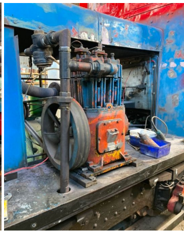
Tr's air compressor