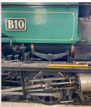
B10 being spannered