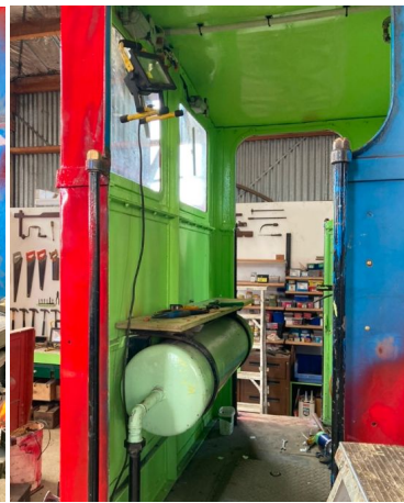
Tr's air tank