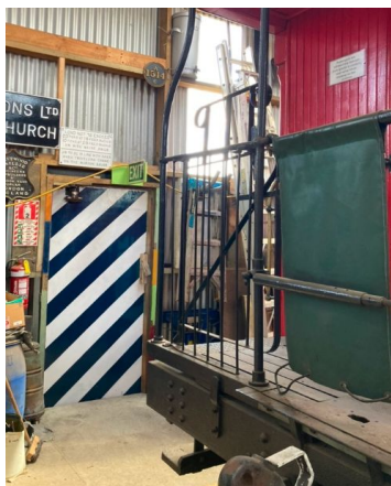
New fire exit door