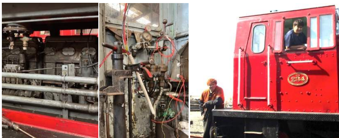
Husky together again

For the DIY-inclined, if you or members of your family are at a loose end on a Wednesday or Saturday, come to the workshop and drive a hammer or paintbrush around! Mechanical, carpentry, engineering and trade skills are very welcome, but we also need people who can hold a shovel or a screwdriver. A fun, rewarding day is guaranteed.