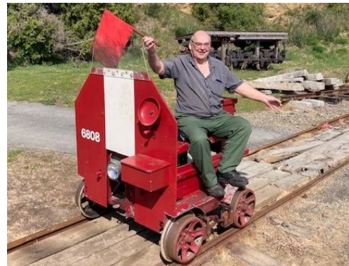
JP recently farewelled his restored track inspection jigger, which headed north on its next adventure.