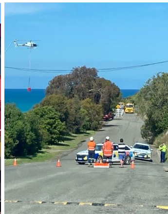
A large fire was started above the tracks by a suspicious vehicle during the Heritage Weekend and two helicopters with monsoon buckets were brought in to assist the local fire crews.